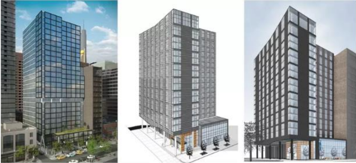
The 24-story iteration as presented by Tishman in 2015 (left); a rough 18-story rendering shared on Skyscraperpage.com in 2016 (center); and the latest, more refined rendering (right).

In October of 2016, Skyscraperpage.com user Spyguy shared what were believed to be updated—albeit roughly sketched-up—renderings of the revised Aloft Mag Mile. Last night, a pair of more polished images were posted to the development-oriented discussion board and confirmed the changes.